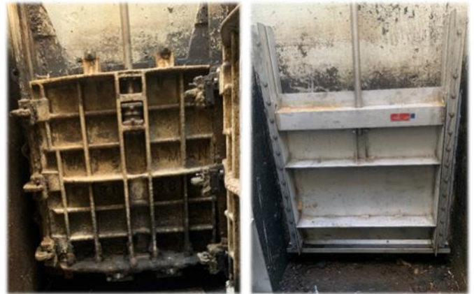
Original installed gate

Staff replaced six sluice gates in the Aeration Basins area this fall. Over the past 10 years, CMSA has been systematically replacing originally installed gates as they reach the end of their working lifespans. This project was challenging, as these gates operate partially submerged, are in a very tight area to work in, and control flow out of the aeration system and into the secondary clarifiers. This required support from several work groups to safely shut down and isolate portions of both systems, while keeping both process areas operational. The original cast iron gates were removed from their frames, and new lightweight stainless-steel gates were installed and then tested for watertightness. Following installation, their actuators were installed and calibrated to ensure that these gates would open and close correctly.